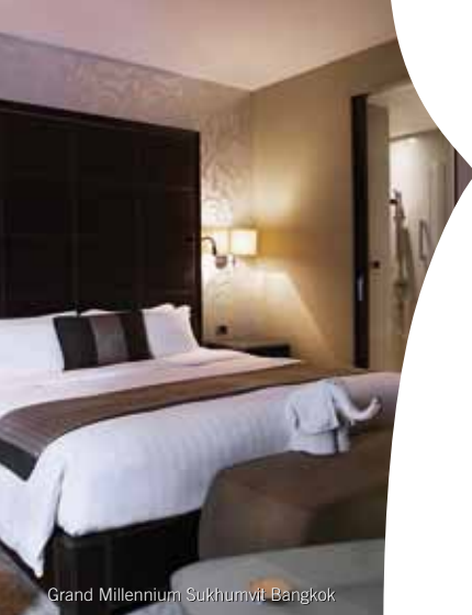
Grand Millennium Sukhumvit Bangkok