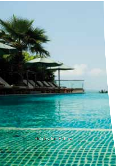
Holiday Inn Pattaya