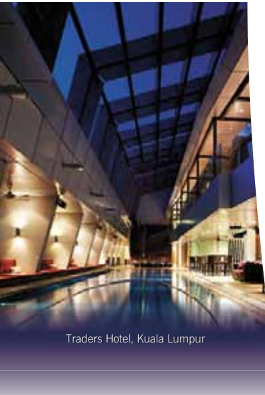
Traders Hotel, Kuala Lumpur